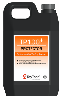
PROTECTOR Protection Fluids